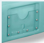
Embedded label holder