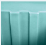
Inner convection groovings