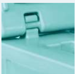
Chest/lid molded hinge, 115° opening