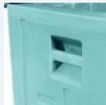
2 molded handles