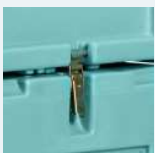
Embedded closing latch - sealable with a padlock/seal