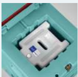
Eutectic plate molded shelf