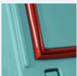
Monobloc frame silicone seal