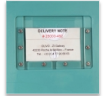
Embedded label holder