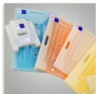
TOP 370 eutectic plate