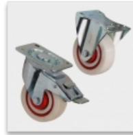
Removable castor base with 4 casters Ø 100 mm, 2 with brake