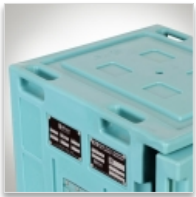
8 moulded handles