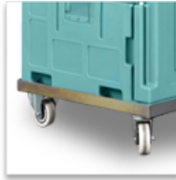
Removable castor base with 4 casters Ø 100 mm, 2 fixed, 2 swivel