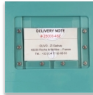
Embedded label holder