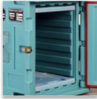
Moulded eutectic plate support