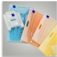
TOP 370 eutectic plate