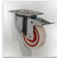
2 braked casters Ø 125 mm