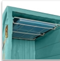
Eutectic plate holder