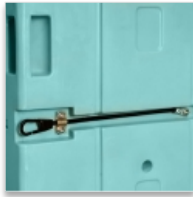
Door hold-open system, half-height door