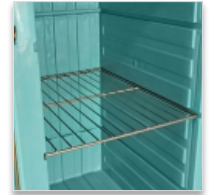
1 to 3 stainless steel shelves