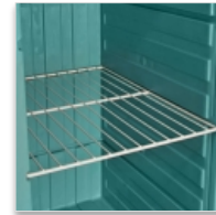
1 to 3 plastic coated steel shelves