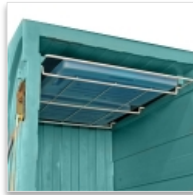
Eutectic plate holder