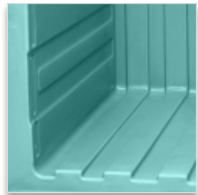
Monobloc rotomoulding. Internal convection grooves