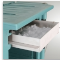
Dry ice drawer