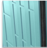
EPDM one-piece frame seal. Door hold-open system