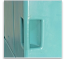
2 embedded moulded handles