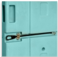
Door hold-open system, half-height door