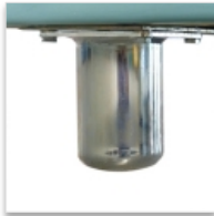
9 metal feet Ø 80 mm