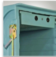
SIBER SYSTEM® dry ice snow tank for chilled and frozen products