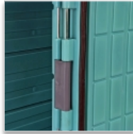
Double axles door hinge. Door opens to 270°