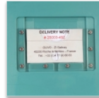
Embedded label holder