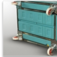
Rustproof treated steel frame, flush mounted, 4 wheels Ø 100 mm , 2 fixed and 2 swivelling