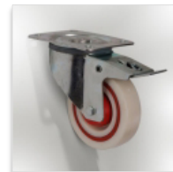
2 brake wheels Ø 100 mm