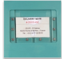
Embedded label holder