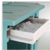
Dry ice drawer