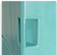
2 embedded moulded handles