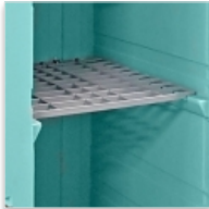
Injected plastic middle shelf – can be folded