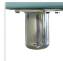
4 metal feet Ø 60 mm