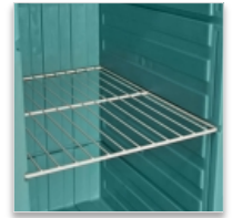
1 to 3 plastic coated shelves