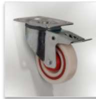
2 brakes wheels Ø 100 mm