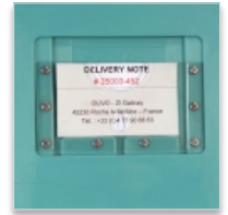
Embedded label holder