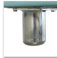
4 metal feet Ø 60 mm