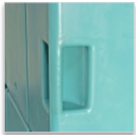
2 embedded moulded handles