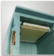
Eutectic plate holder