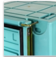
EPDM one-piece frame seal. Door hold-open system.