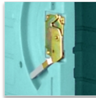
2-points « pelican » quick closing system, rustproof treated