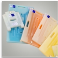
1 to 2 TOP 780 eutectic plate