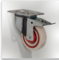
2 brake wheels Ø 100 mm