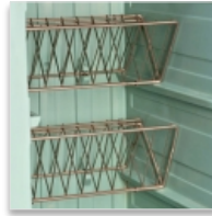
2 stainless steel shelves, in 3 parts, that can be lifted and folded, fixed at the rear of the roll