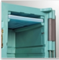
Moulded eutectic plate support