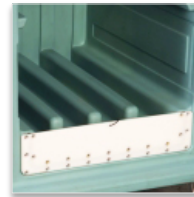
Bottom water collection