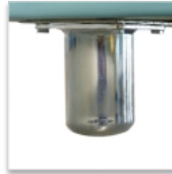
4 metal feet Ø 60 mm