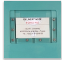
Embedded label holder