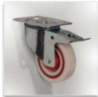
2 braked casters Ø 125 mm